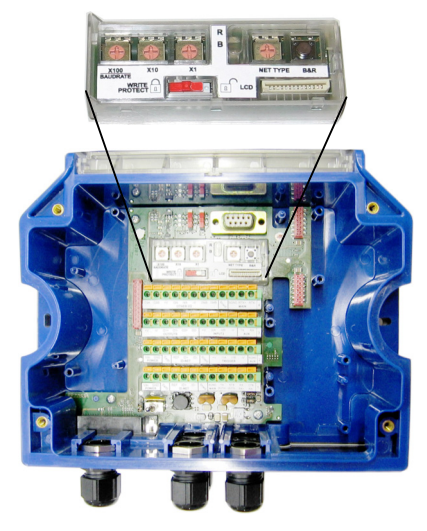
Figure 2 – BM100 Mounting